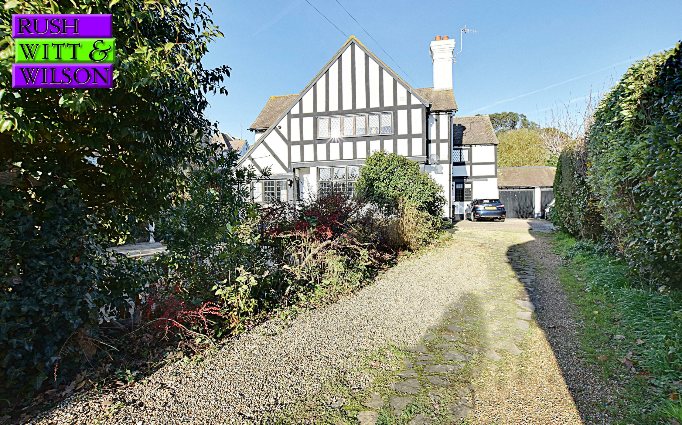
Tudor Cottage, 38 Manor Road, Bexhill-On-Sea, East Sussex TN40 1SN £425,000 Share of Freehold